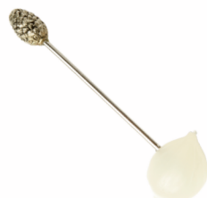
ONIONS COCKTAIL #131205, 12/32 oz Packer