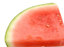
WATERMELON #109234 1/1 CT