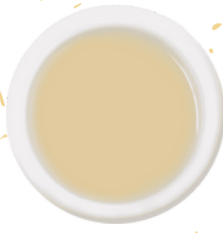
LADY LYCEE PUREE #845010, 6/30 OZ