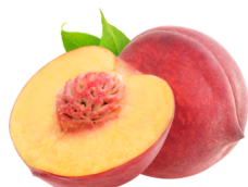
PEACHES *seasonal #102875 1/25 lb