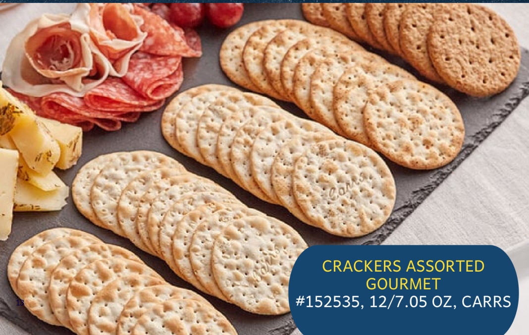
CRACKERS ASSORTED GOURMET #152535, 12/7.05 OZ, CARRS