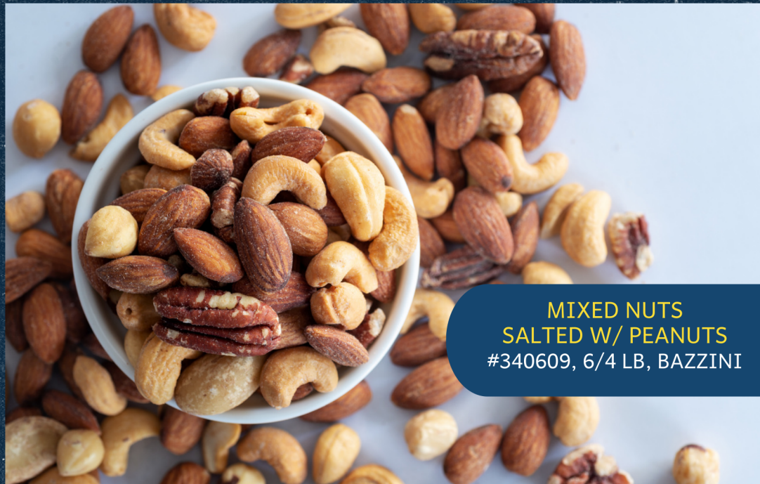
MIXED NUTS SALTED W/ PEANUTS #340609, 6/4 LB, BAZZINI