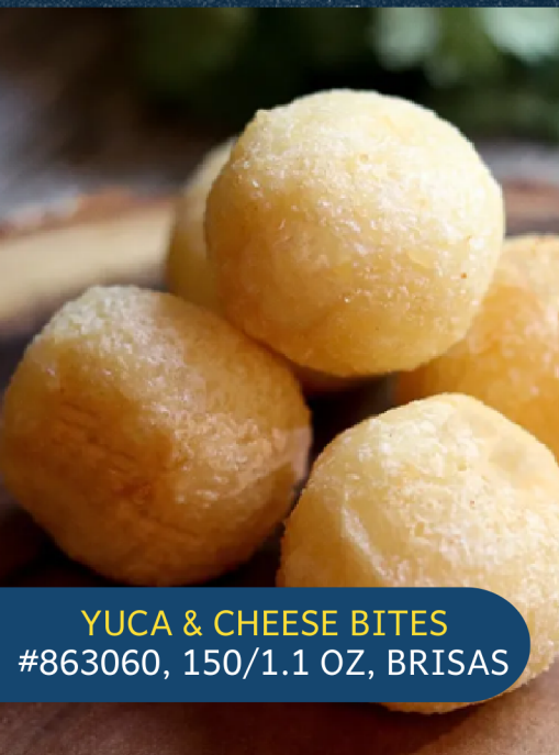
YUCA & CHEESE BITES #863060, 150/1.1 OZ, BRISAS