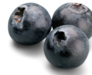
BLUEBERRIES #102321 12/1 PT