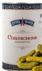
CORNICHONS EXTRA FINE GHERKINS #390431 6/4.2 KG Eiffel Tower