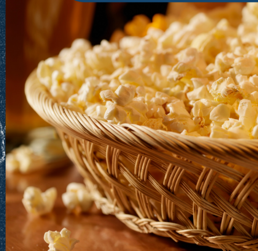
POPCORN KERNELS #485009, 1/50 LB