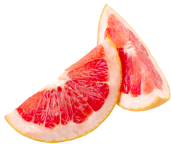
GRAPEFRUIT #109083 1/32 ct