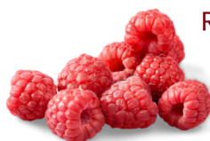
RASPBERRIES #109862 12/.5 PT