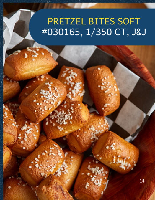
PRETZEL BITES SOFT #030165, 1/350 CT, J&J

Ask to see our Apps & Comfort Food Catalogs for a full list of bar food offerings!