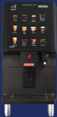
CORE BARISTA 40

VOLUME NEEDED: +50 CUPS PER DAY 6 CASES PER MONTH