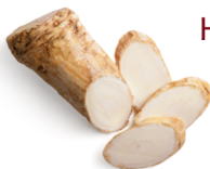
HORSERADISH ROOT #109090 1/5 lb