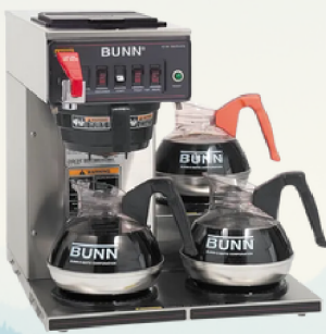
3 BURNER BOTTLE BREWER