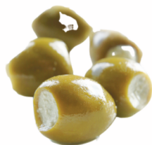
OLIVES STUFFED W/ BLUE CHEESE #360628, 2/5 lb Packer