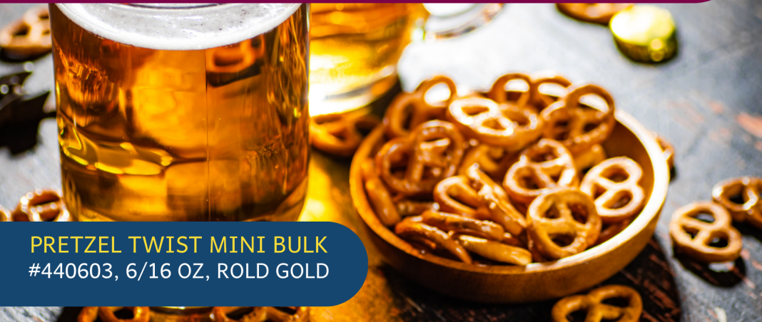
PRETZEL TWIST MINI BULK #440603, 6/16 OZ, ROLD GOLD