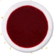
RED RASPBERRY PUREE #845020, 6/30 OZ