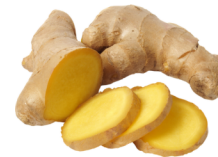
GINGER #109080 1/30 lb