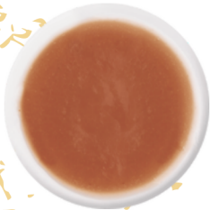
WHITE PEACH PUREE #845119, 6/1 KILO