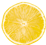
LEMONS #109102 1/140 CT