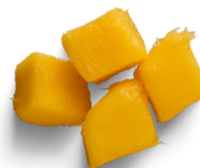
MANGO #109127 1/8-10 CT