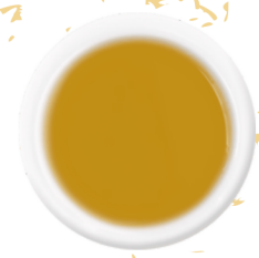
CARAMELIZED PINEAPPLE PUREE #845134, 6/30 OZ