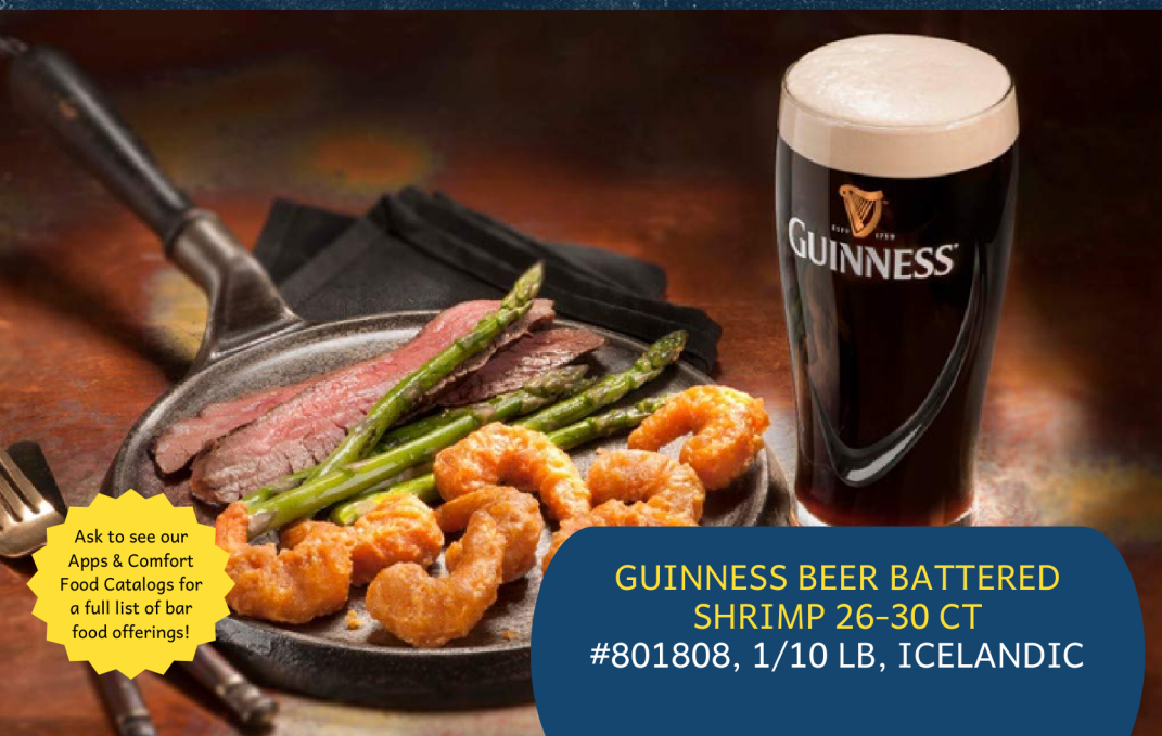
GUINNESS BEER BATTERED SHRIMP 26-30 CT #801808, 1/10 LB, ICELANDIC

Ask to see our Apps & Comfort Food Catalogs for a full list of bar food offerings!