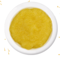
LEMON ZEST PUREE #845036, 6/35 OZ