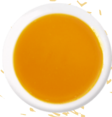
PASSION FRUIT PUREE #845118, 6/1 KILO