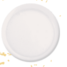
COCONUT PUREE #845026, 6/30 OZ