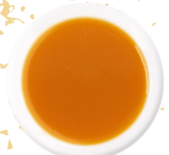
APRICOT PUREE #845037, 6/30 OZ