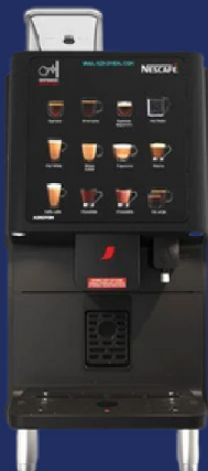
TOTAL BARISTA 30

VOLUME NEEDED: +40 CUPS PER DAY 5 CASES PER MONTH