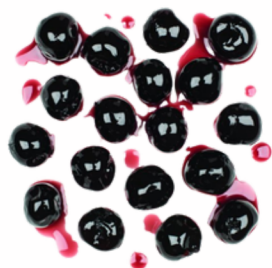
AMARENA CHERRIES IN SYRUP #130403, 2/3.1 KG Roland