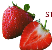
STRAWBERRIES #109221 8/1 PT