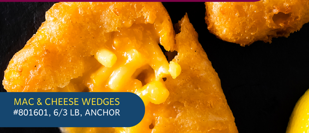
MAC & CHEESE WEDGES #801601, 6/3 LB, ANCHOR