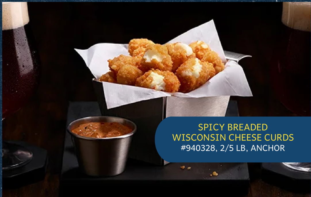
SPICY BREADED WISCONSIN CHEESE CURDS #940328, 2/5 LB, ANCHOR