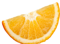
ORANGES #102537 1/113 CT