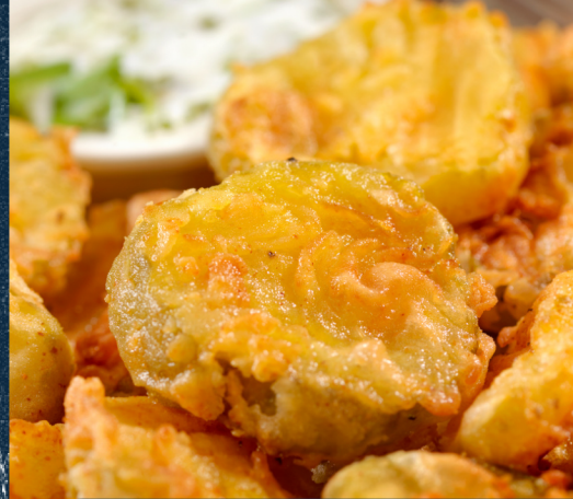
CRISPY TEMPURA PICKLE CHIPS #700287, 4/2 LB, CAVENDISH