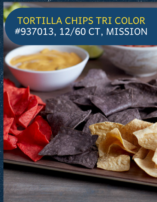
TORTILLA CHIPS TRI COLOR #937013, 12/60 CT, MISSION