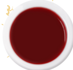
BLOOD ORANGE PUREE #845112, 6/1 KILO