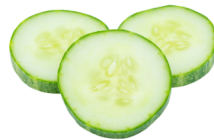
CUCUMBERS #109068 1/12 CT