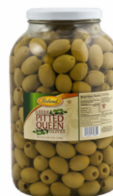
OLIVES SPANISH QUEEN PITTED #363020, 4/1 gal Roland