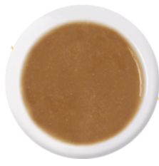
TAMARIND PUREE #845024, 6/30 OZ