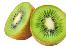
KIWI #109099 1/CS