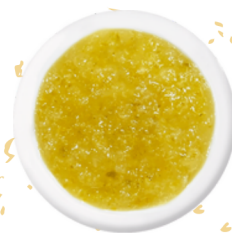
LIME ZEST PUREE #845038, 6/35 OZ