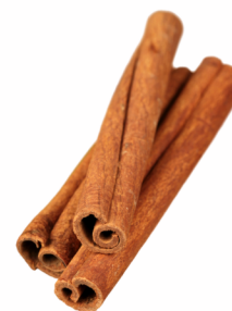
CINNAMON STICKS #481274, 4/3 lb Packer