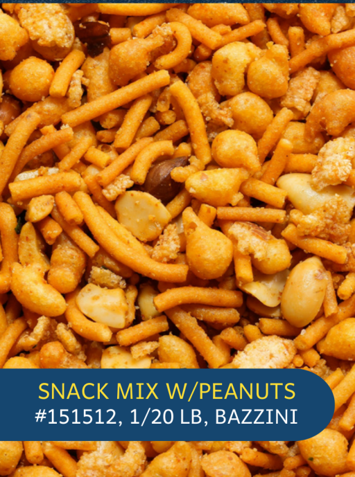
SNACK MIX W/PEANUTS #151512, 1/20 LB, BAZZINI