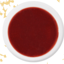
STRAWBERRY PUREE #845122, 6/1 KILO