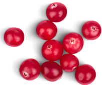
CRANBERRIES *seasonal #109858 24/12 oz