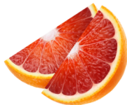
BLOOD ORANGES #109161 1/44 CT