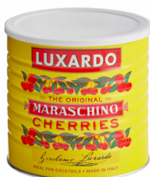
CHERRIES LUXARDO MARASCHINO #470457, 4/3 KG Luxardo